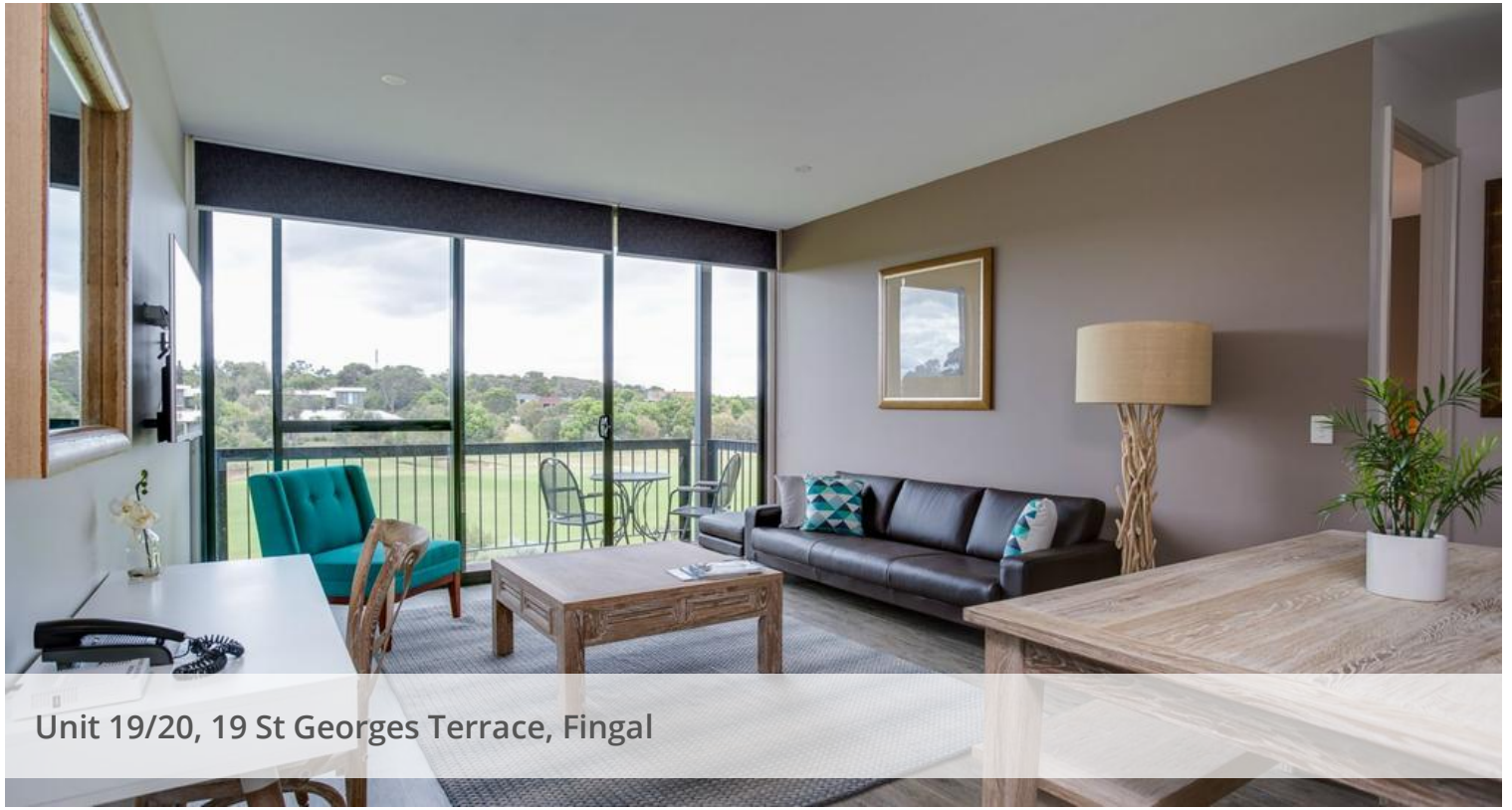
Unit 19/20, 19 St Georges Terrace, Fingal